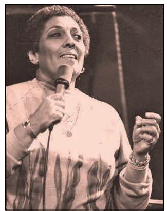
Just Jazz Artist of the Month singer Carmen McRae